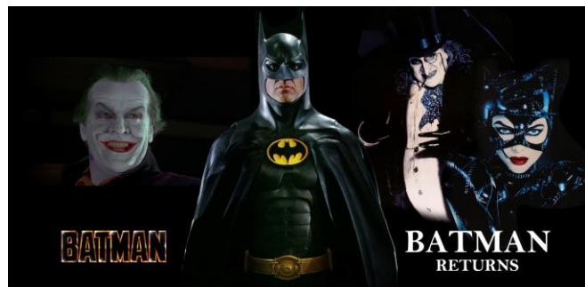
BATMAN DOUBLE BILL (12a) - Normal Prices Sunday at 17:30